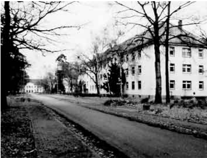
Karlsruhe, Germany – US Army barracks, circa 1959.

However, the MP's were, first and foremost soldiers, and that stark reality was delivered to the unit during the summer of 1958. At that time, the Lebanese Crisis burst onto the world scene and the 285 th was one of the few MP Companies that was required to deploy to the insurrection.