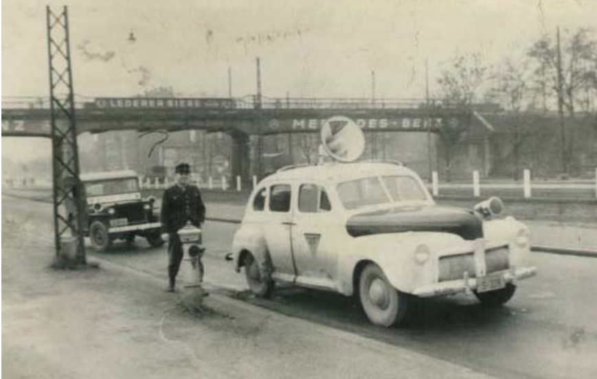
Military Police equipment, Europe, circa 1950.

These, as well as other factors, resulted in the USAREUR Provost Marshal assigning the 285 th MP Company to Karlsruhe Germany in November of 1957. 163 The 285 th MP's began moving to Karlsruhe that month and by early 1958 the re-location had been completed.